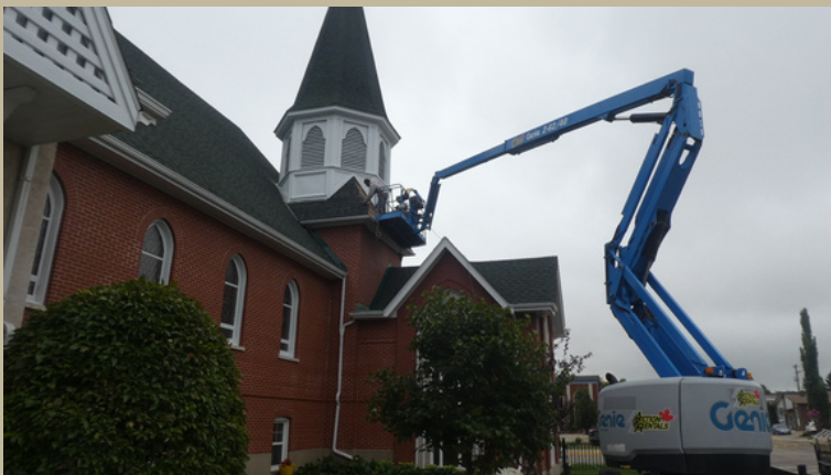
Reshingling around the steeple